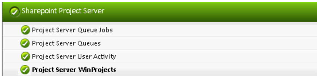
Figure 3.2: The tests mapped to the Sharepoint Project Server layer

This layer monitors the Microsoft Project Server and tracks its critical performance statistics pertaining to the jobs in the queue, the user activity on the server and the statistics of the project such as the number of incremental saves, full saves, full open etc.