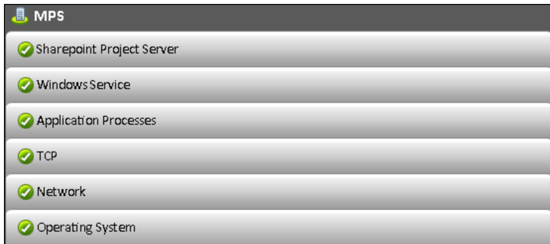
Figure 3.1: The layer model of the Microsoft Project Server

eG Enterprise offers a specialized monitoring model for the Microsoft Project Server, which does all this and more!