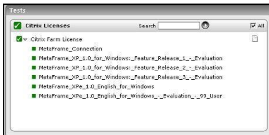
Figure 1.4: Tests associated with the Citrix Licenses test

To track the product and connection licenses for a Citrix server zone, use the CitrixFarmLicense test.