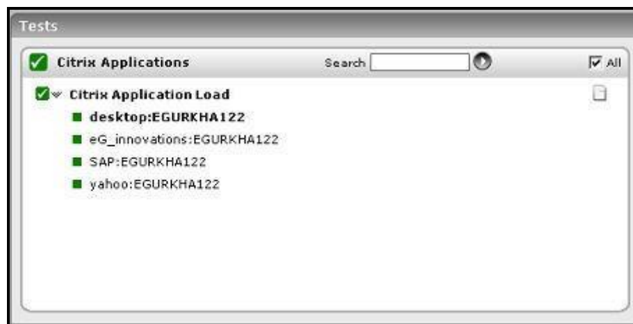
Figure 1.5: Tests associated with the Citrix Applications layer

The CitrixApplicationLoad test that is mapped to this layer enables you to identify the most popular application in the Citrix zone, as it reveals the load per application.