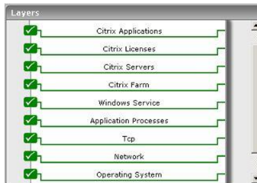
Figure 1.1: The layer model of a Citrix ZDC

Using the metrics reported by each layer of Figure 1.1, administrators can find quick and accurate answers to the following performance queries: