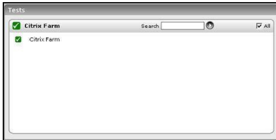
Figure 1.2: The tests associated with the Citrix Farm layer

Verify the availability and responsiveness of a Citrix farm by executing the CitrixFarm test that is mapped to this layer.