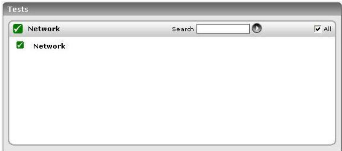
Figure 1.2: The test mapped to the Network layer

This layer monitors the availability of the Bluecoat AV over the network, and alerts you to bad network connections (if any) to the anti-virus.